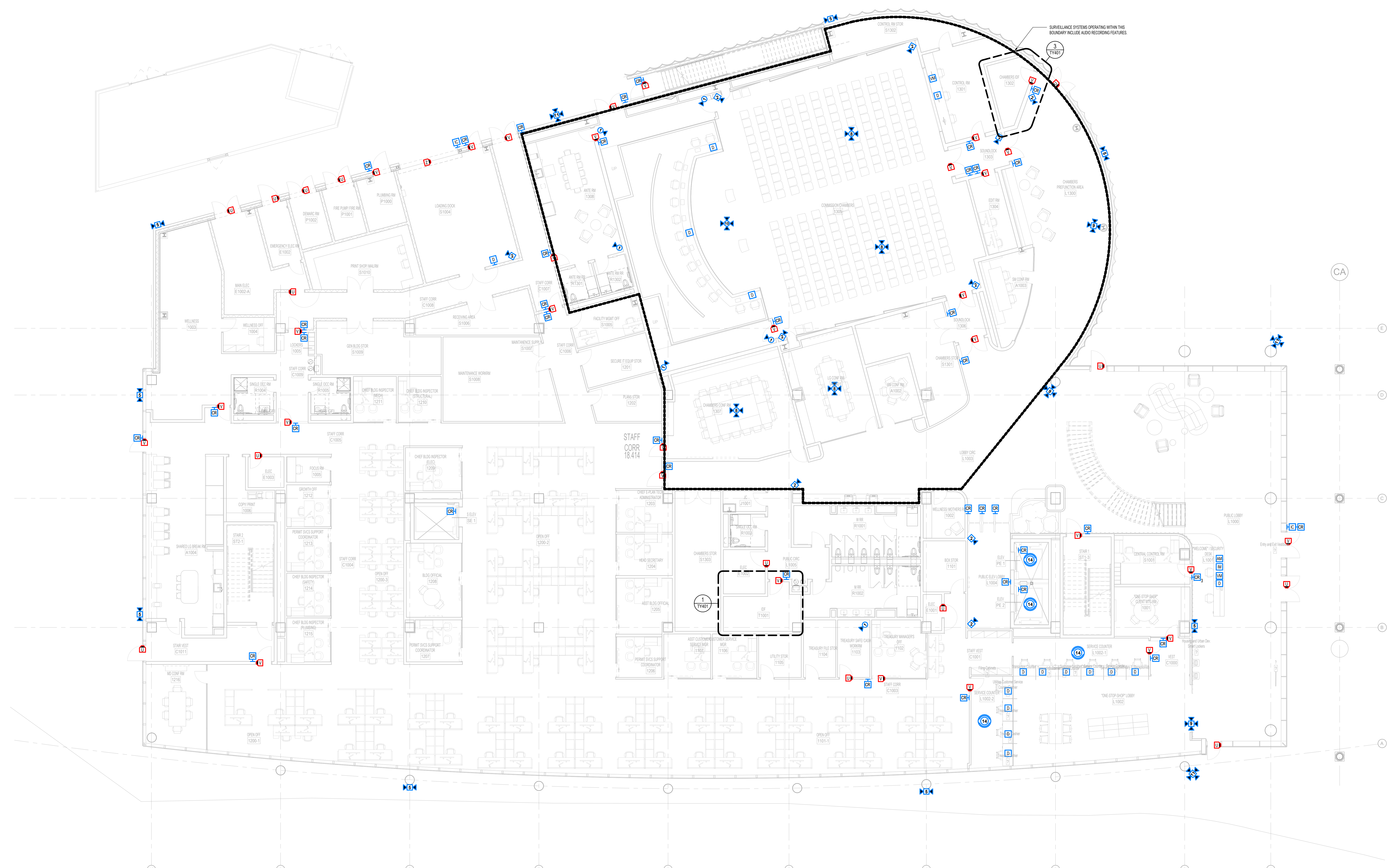
1 SECURITY FLOOR PLAN - LEVEL 1 - CITY HALL 1/8" = 1'-0"